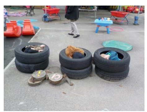
Anyone for hide and seek?

If you need any more information please telephone the pre-school on 01580 819218 (option 5) or email: <u>helen@etchinghambarnowls.co.uk</u>.